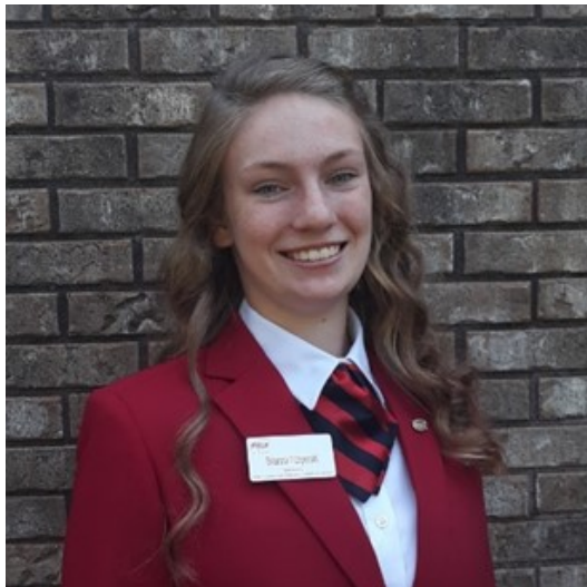
Ohio FCCLA State Secretary