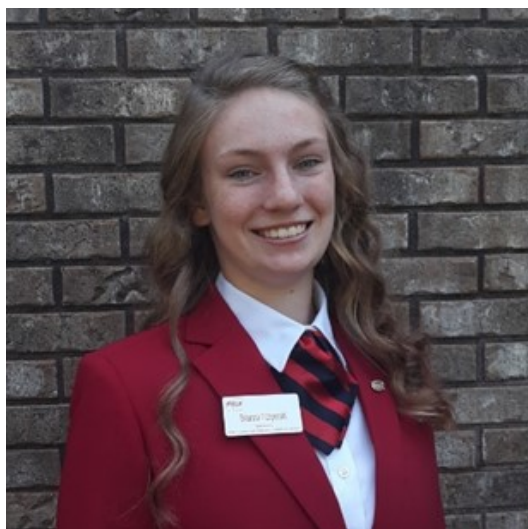
Ohio FCCLA State Secretary