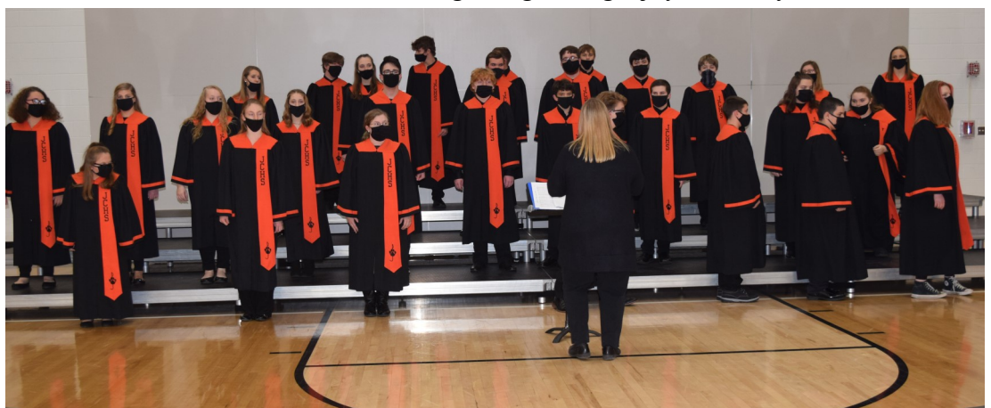
High School Choir Christmas Performance

And finally thanks to our students, who have had to endure many strange changes this year. Masks, social distancing, cancelled events and sometimes mixed messages from the media and politicians in our state and across the country. They have shown INCREDIBLE resilience to the virus as well as all the changes they have been asked to make in this first 16 weeks. We are extremely proud that even though they might not always say it, they love being at school with their teachers and their enthusiasm has made learning and growing a joy for everyone!