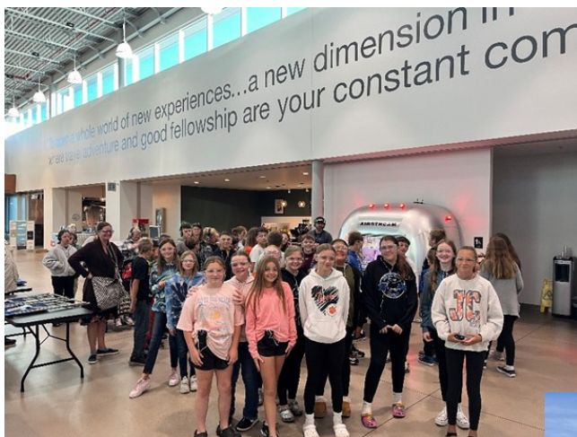
6th Grade at Airstream