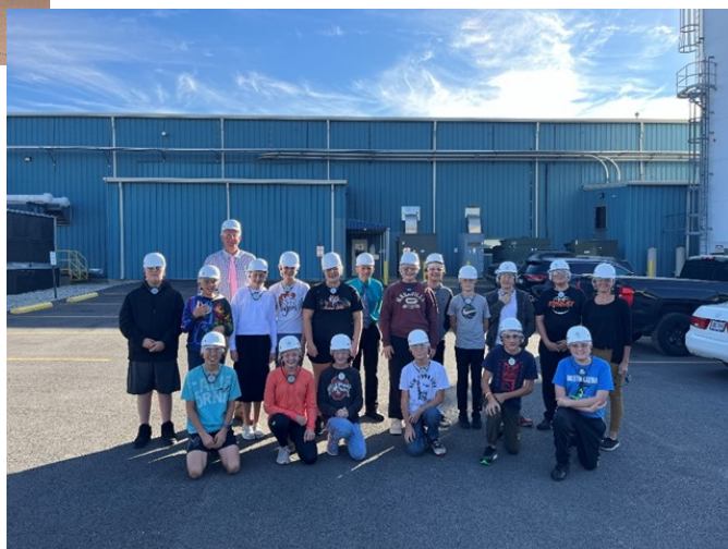
7th Grade at Plastipak

This is a part of a program being launched by the Therl Johnson Chapter of the National Honor Society.